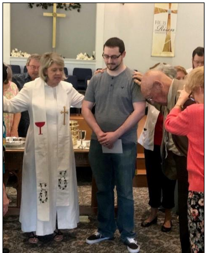
Providence joins together in blessing with a laying on of hands.