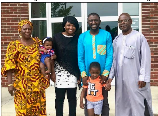
The Bauta Family